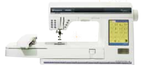
1998 DESIGNER I™

2004 – The technically astounding new top-of-the-line machine DESIGNER SE™ sewing machine was launched with groundbreaking technology such as Interactive DESIGNER™ Screen, LED lights, exclusive EMBROIDERY ADVISOR™ feature and USB connectivity.