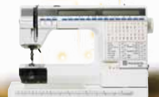
1989 MODEL 1100

Visit www.husqvarnaviking.com to explore more about our historic products.