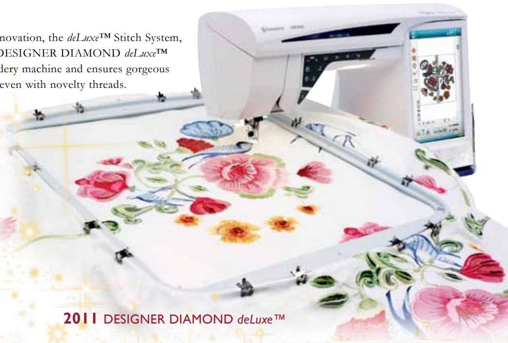
2011 DESIGNER DIAMOND deLuxe™

Our most recent innovation, the deLuxe™ Stitch System, is featured on the DESIGNER DIAMOND deLuxe™ sewing and embroidery machine and ensures gorgeous embroidery results even with novelty threads.