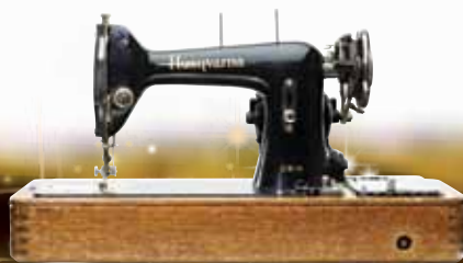
1934 CBN CLASS 12