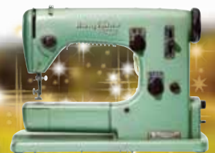
1953 CLASS 20