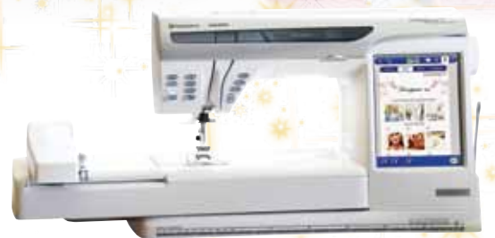
2004 DESIGNER SE™

1998 – A completely new sewing experience commenced: the HUSQVARNA VIKING® DESIGNER I™ sewing machine, with unique, new-to-the-world features including The Sensor Foot Lift, Sensor Foot Pressure, Selective Thread Cutter, Color Touch Screen, Built-in Disk Drive and more developed embroidery capabilities.