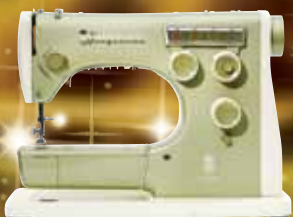
1960 MODEL T2000