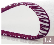
2-Thread Overlock Wide & Narrow Finish an edge before you sew fabrics together with a regular straight stitch.