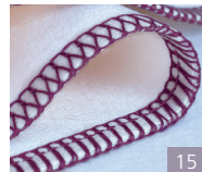
4-Thread Overlock Seam Seam, overcast the edge and trim away excess fabric in one step. For all seams where stretch or give is needed, such as neck edges, side seams, sleeves.