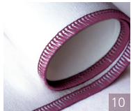
3-Thread Stretch Overlock For sewing extra stretchy light or medium weight fabrics. (Add additional stretch by using a stretchy type thread in the loopers.)