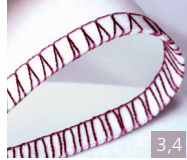
2-Thread Wrapped Edge Overlock Wide & Narrow Beautiful finish for lightweight or wool fabrics.