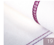
Coverstitch Narrow For hems on stretch fabrics and for decorative effects on all kind of fabrics. Use decorative thread in looper for embellishment.