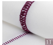
3-Thread Flatlock, Narrow Sew stretchy fabrics together with a decorative effect, either with the flatlock side or the ladder stitch side.