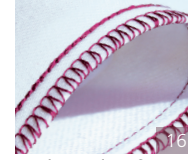
4-Thread Safety Stitch, Narrow For joining with reinforced stitching and overcasting in one step.