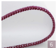
2-Thread Narrow Edge Edge finish for light and medium weight woven fabrics and lightweight knits.