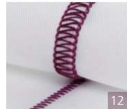
3-Thread Flatlock, Wide Sew stretchy fabrics together with a decorative effect, either with the flatlock side or the ladder stitch side.