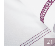
Coverstitch Triple For hems on stretch fabrics and for decorative effects on all kind of fabrics. Use decorative thread in looper for embellishment.