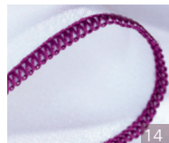
3-Thread Narrow Edge Give a professional finish to silky scarves, pillow ruffles and napkins.