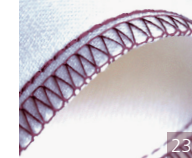
5-Thread Safety Stitch, Wide A durable chainstitch seam with overlock edge sewn in one step, for garment sewing, quilt piecing and other projects.