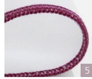
2-Thread Rolled Edge Edge finish for lightweight fabrics. Nice finish on silky scarves, pillow ruffles and napkins.