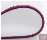
3-Thread Rolled Edge Give a professional finish to silky scarves, pillow ruffles and napkins.