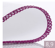
3-Thread Overlock, Wide & Narrow Seam, overcast the edge and trim away excess fabric in one step.