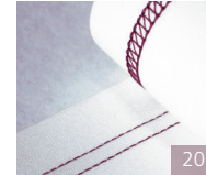
Coverstitch Wide For hems on stretch fabrics and for decorative effects on all kind of fabrics. Use decorative thread in looper for embellishment.