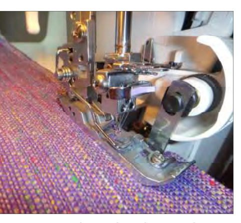
seaming, trimming, and overcastting with one pass under the needle(s)