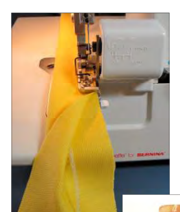
Serge with chain inside the fabric

Move the fabric along the tube to turn to the right side