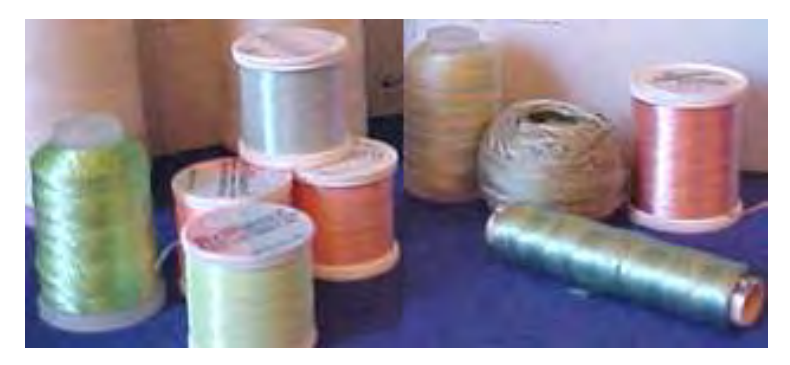
Heavy decorative threads such as Pearl Crown Rayon, Designer 6, Jeans Stitch, Candlelight, and Ribbon Floss are great for decorative edges.

Flat (not rolled) decorative edges are easy to stitch. The same as a balanced 3-thread overlock stitch, using decorative threads in the loopers gives a quick, professional-looking finish for all types of projects, from baby blankets to garments to purses.